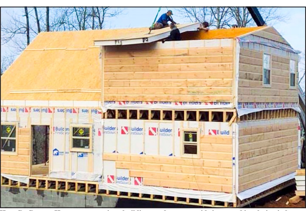
HayeCo Custom Homes uses a unique building product to provide increased insulation in homes and other benefits.

layers of oriented strand board that sandwich a thick layer of expanded polystyrene foam to form a complete panel.